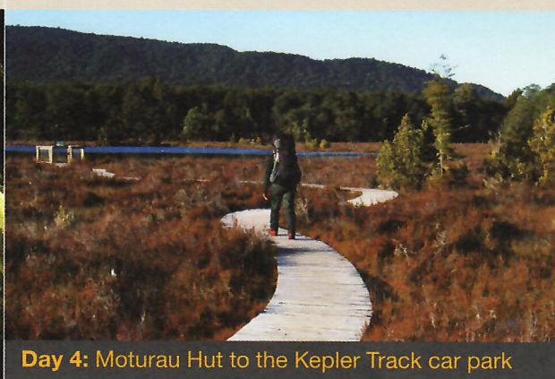
Day 4: Moturau Hut to the Kepler Track car park

Experience ever-changing scenery as the track takes you over a low saddle, then down past a large slip caused by heavy rain to Rocky Point. You'll then wind through a gorge and lowland beech and podocarp forest, before reaching the shore of beautiful Lake Manapouri. The beach-side Moturau Hut has stunning views of the lake.