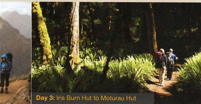
Day 3: Iris Burn Hut to Moturau Hut