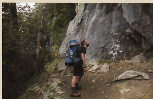
Day 1: Kepler Track car park to Luxmore Hut